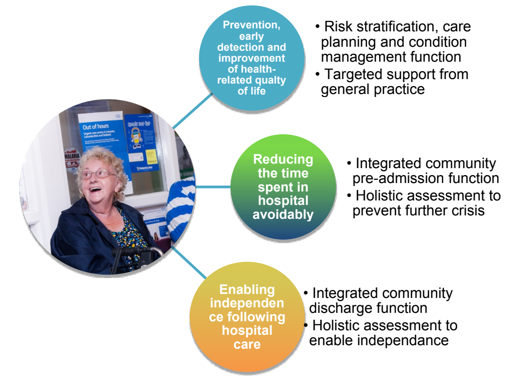
The Leicester City pre- and post-hospital pathway

For this population, we propose to continue to invest in specific services in the following areas: